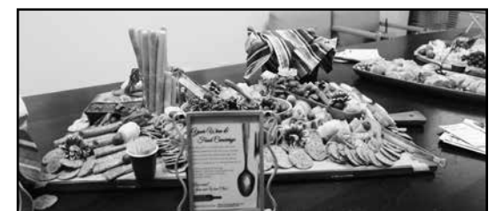
Catering and wine by Savour Sensations