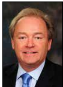
By Dan Armstrong Special to the Recorder

How frequently you should review your estate plan depends on how old you are and whether there has been a significant change in your circumstances.