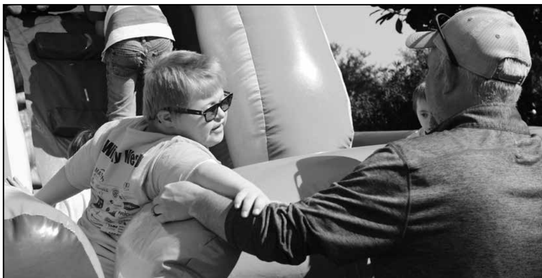
LEFT: Families enjoy the bouncy slide outside the Baymeadows location of The Church of Eleven22.

Down syndrome, who, according to a recent study from researchers at MassGeneral Hospital for Children (MGH-FC) and colleagues in the Netherlands, never stop learning and acquiring functional skills throughout their lives.