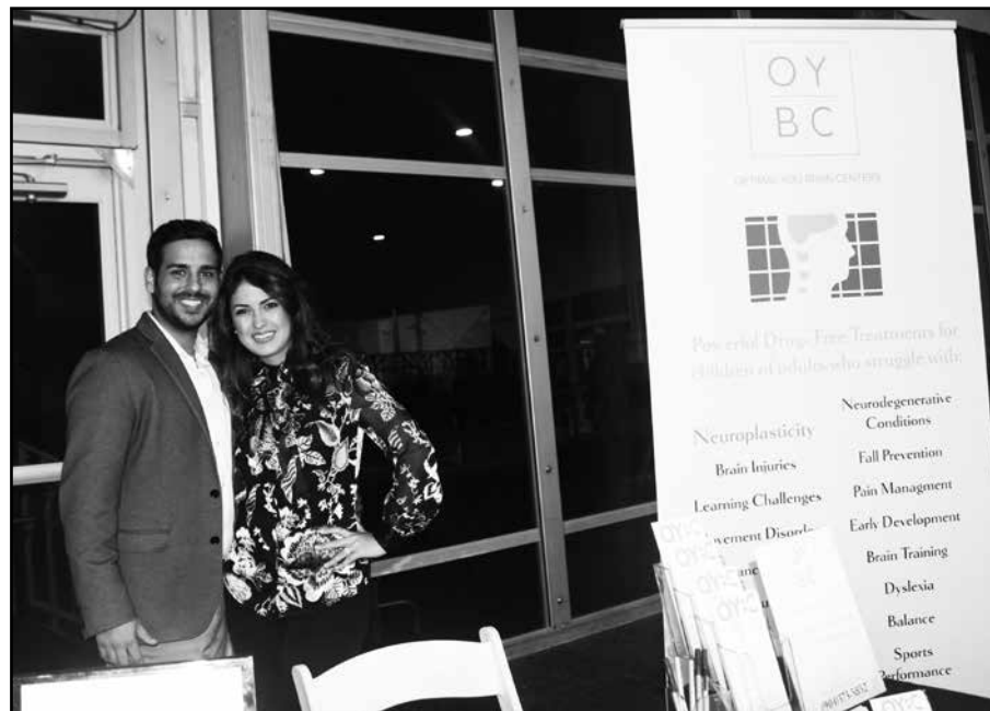
The Optimal You Brain Centers team