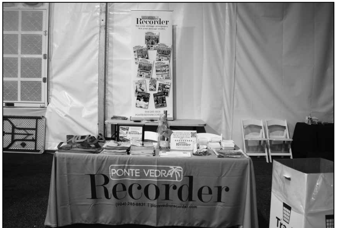
The Ponte Vedra Recorder table