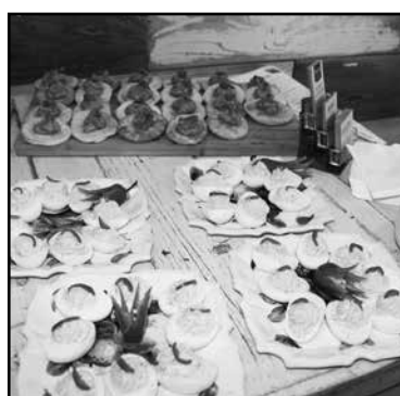
Food at the "Before Hours" event