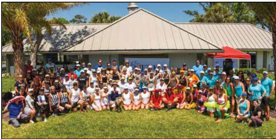
The colorful teams from last year's KATE KUP Tournament pose for a group shot.