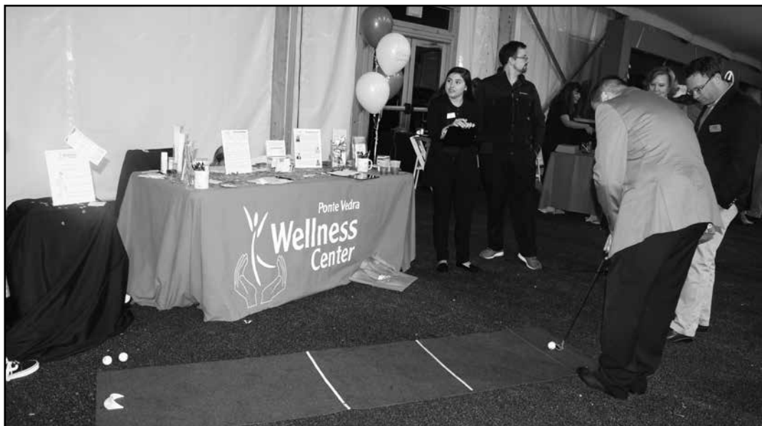
Guests at the event enjoy visiting the Ponte Vedra Wellness table.