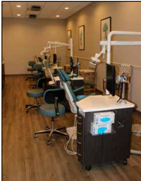
The practice offers orthodontics, emergency care, pediatric anesthesiology, preventative care, extractions, fillings and crowns, among other services.

Opening its location in Ponte Vedra Beach in September 2018, the Sawgrass Village office is open on Wednesdays from 1 to 3 p.m. and Fridays from 7:30 a.m. to 3 p.m. The practice also has a location on Bayberry Road in Jacksonville. Visit www.setzerandcochran.com for more information.