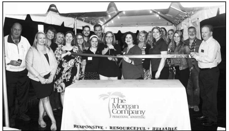
The Morgan Company celebrates its office relocation to the Hodges and Butler Boulevard area with the Chamber of Commerce on Feb. 27.