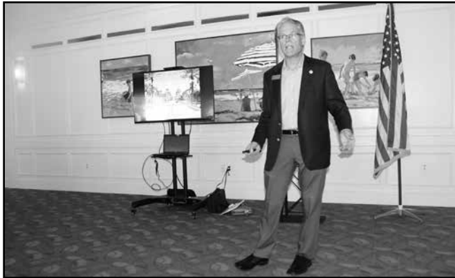
Goldman addresses event attendees about tourism in the area.